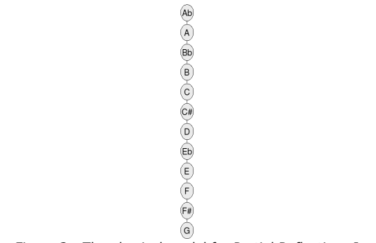
Figure 2 - The physical model for Partial Reflections I

Each sphere in the model is associated with a particular pitch-class (or note) and by playing into the microphone connected to the computer the musician can exert forces on the model. If the player plays a G for example, then the sphere at the bottom of the model is pushed with a force that is proportional to the volume of that note. When no notes sound the model returns to its resting position, hanging down from the top of the screen.