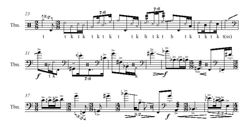
Figure 5 - Excerpt from the second movement of 'Partial Reflections' for trombone and interactive virtual sculpture..

Musically, the notated composition developed along with this software is fast-paced and makes use of many different types of articulation. In addition to pitched notes, the performer also makes use of unpitched percussive attacks at times (such as in the top line of music in figure 5).