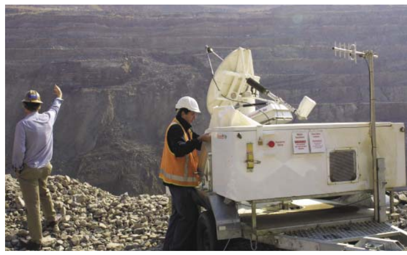
GroundProbe slope stability radar

Overall the nation is $1.14bn better off, or 60 cents wealthier for every dollar invested by the Australian Government in the CRC Programme.